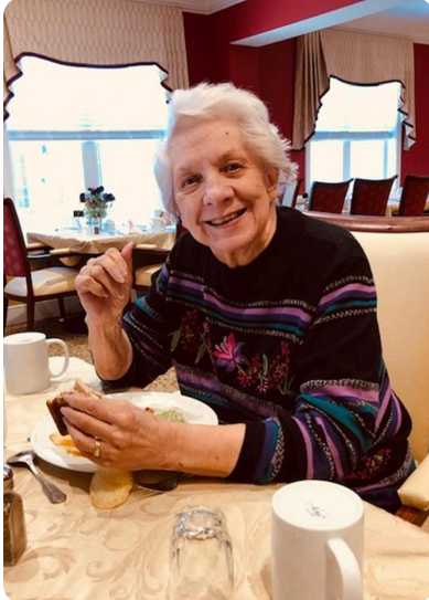
Mom at Spring Arbor, the assisted living facility, on move-in day, Nov. 4, 2019.