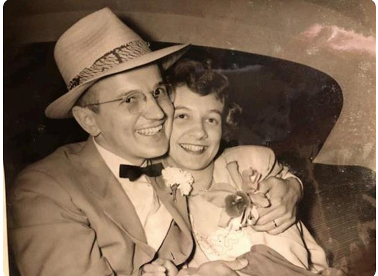
Wedding Day, June 15, 1954.