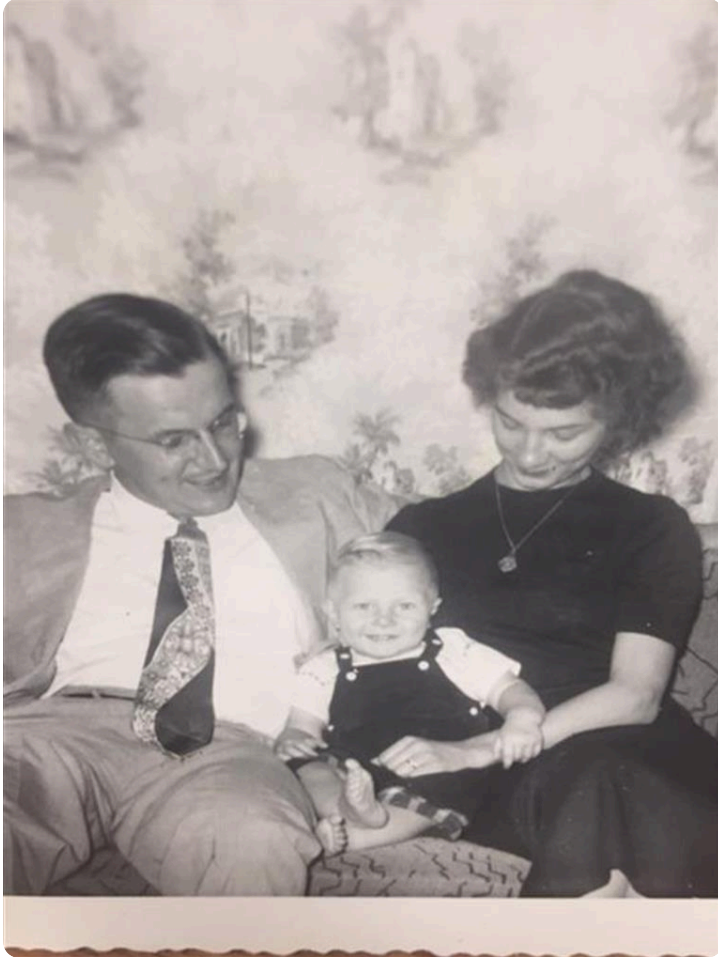
Practicing parenting with a nephew.